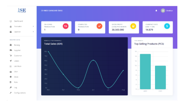
Figure 3 Dashboard Page

Figure 3 shows the dashboard which is the main page that the user will be redirected to after successful login to the system. The sidebar show menu that will be available in the system. The menu will be categorized into master data, transaction, and report. This chapter will focus more on the transaction menu. The Transaction Menu consists of 3 sub-menus that are purchase transaction, sales transaction, and payment transaction.