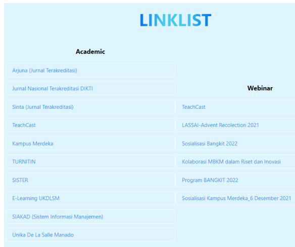
Figure 3. The Display of Application (user)

Currently this web application can only be used by 1 (one) admin as a user for single access. In case we want a collaboration, it can be set by inform the admin username and password to the group, and everyone can access the application and can use the store, edit, or remove features (collaboration works).