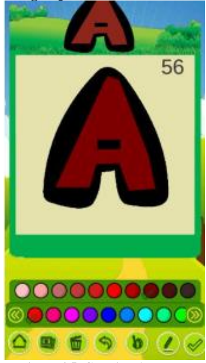
Figure 4.5. Coloring Alphabet