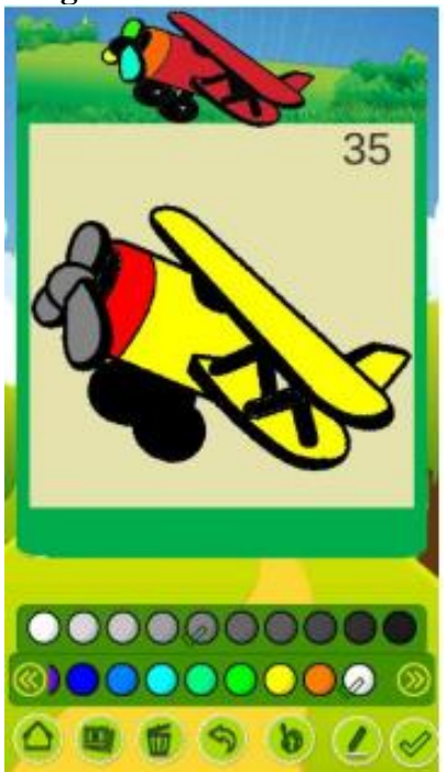
Figure 4.3. Coloring Vehicle

The choice of receiving animals adds knowledge about various types of advice starting from land, air and water.