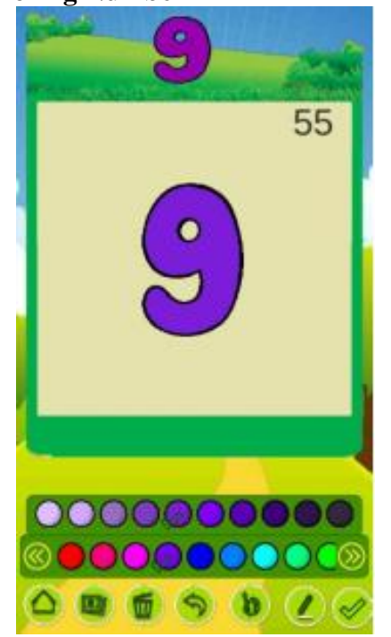
Figure 4.4. Coloring Number