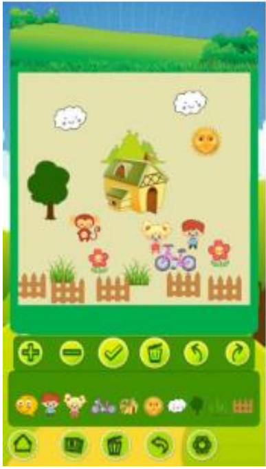
Figure 4.1. Paste The Image