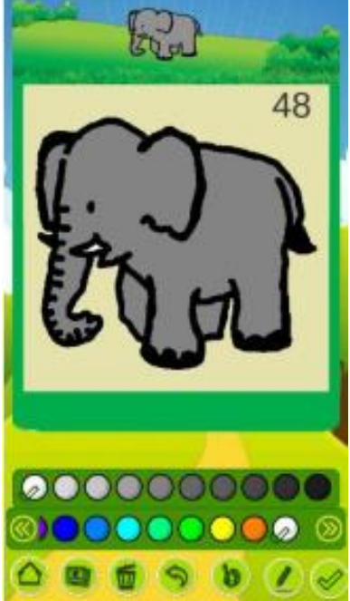
Figure 4.2. Coloring Animal

The choice of receiving animals adds to the knowledge of various kinds of animals ranging from land, air and water.