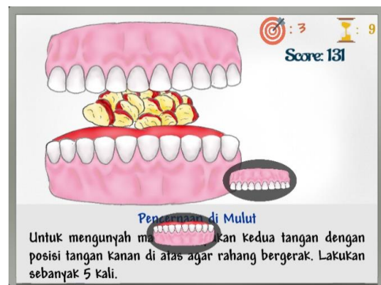
Figure 2. Gameplay Stage 1

After the design and development of the game is complete. Then a trial was conducted on 30 students from several junior high schools in Semarang city and a posttest questionnaire was distributed related to this game for human digestive system learning media based on motion sensor. Figure 2 is an example of the appearance of gameplay in stage 1.