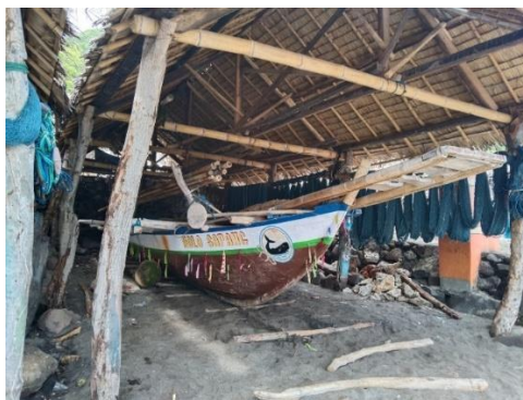
Figure 4: Sailboats parked in the nation on the shores of Lamalera Beach. Source: Alexander Aur's personal collection, November 2022

so that it remains focused on the shared vision led by the lamafa on the bridge of the sailboat.