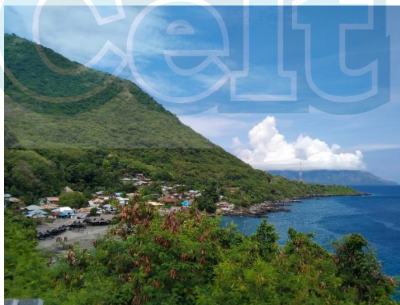
Figure 1: Lamalera B Village in Lembata District, East Nusa Tenggara.

In Lamalera B village there is one government bank agent, namely an agent for Bank Rakyat Indonesia, and one Nusa Tenggara Timur branch office bank. The facilities of this financial institution are used by residents of the two villages to receive and send money. The existence of this facility also shows that residents of the two villages carry out financial transactions. This transaction shows that residents have economic income from outside and residents also send money abroad, especially for the education costs of children outside Lembata. Lamalera was a village, which the traditional fishing community of Lamalera called lefo . Below is a photo of Lamalera as lefo and as a part of Indonesia's modern state.