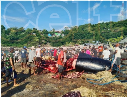
Figure 3: Distribution of whale meat on Lamalera Beach in November 2022.

The resource person was interviewed by researchers in August 2022 in Cibubur. He said that the traditional fishing community of Lamalera has several expressions related to this series of capabilities, namely "to the sea", "at sea", and "to go to sea". "To the sea" means that the Lamalera people orient their lives towards the sea. "At sea" means that every fisherman while at sea has a mandate from the village to bring back whales and sea fish to fulfill the villagers' need for food (figure 3). Meanwhile, "going to sea" means catching whales and other fish as an activity of life. Therefore, the social capability "ola nua-lefa nua" is a life activity with a social-ecological dimension. In other words, ola nuâng-lefa nué is a series of social-ecological capabilities contained in the life universe of the traditional Lamalera fishing community. This series of capabilities is an ethical value that is actualized in social life in Lamalera village.