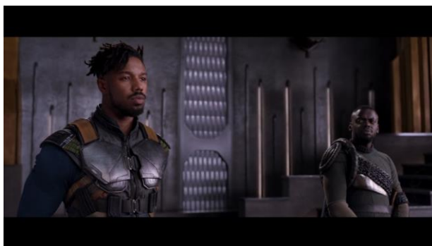
Figure 1: Killmonger's cousin meeting a Shaman

[Data 2] "You're Erik Stevens. An American black operative . A mercenary nicknamed Killmonger." (Coogler, & Cole, 2016, p. 79)