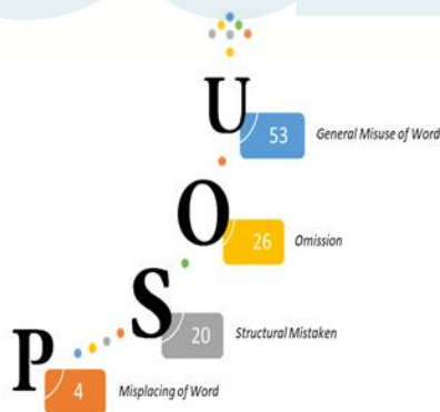
Figure 1: Frequency of Interlingual Interference in Students' Translation Project

Based on four categories of interlingual interference, Figure 1 showed the frequency of interlingual interference occurred in translating children's literature by the participants of this research. This presentation was derived from 10 students' error during translation project. Figure 1 presented that the most common interference occurred was the 'general misuse of words'. Student, in his translation project, generated the most errors in this category.