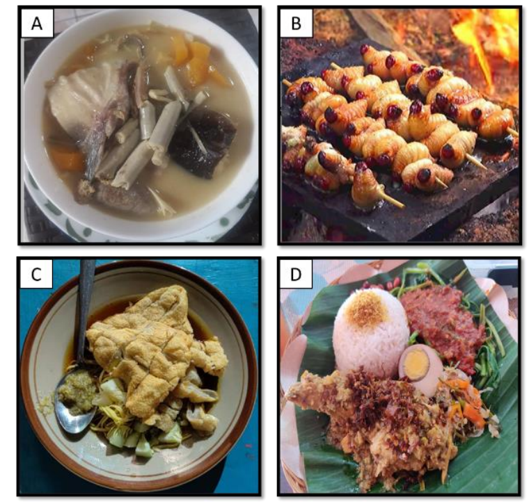
Figure 2. A & B: the least familiar ethnic foods ( umbut rotan and sate ulat sagu , respectively), C & D: the most familiar ethnic foods ( pempek palembang and ayam betutu , respectively) (source: private source, A: kindly provided by Mr. Menteng Gohong; B: taken from Instagram under permission and support from @yoboi.faa).