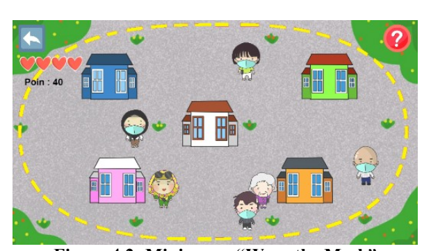
Figure 4.2: Mini-game "Wear the Mask"

This game has the settings in a residential complex. Many people leave their homes to fulfill their own needs. In this era of the COVID-19 pandemic, we must always wear masks outside the house. So, the rule of this game is, the player must tap on the person who is not wearing the mask properly, and don't let people with no mask pass the yellow border. Figure 4.2 below is the user interface of the mini-game "Wear the Mask".