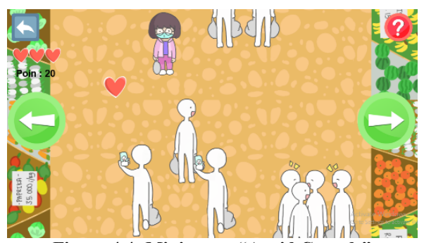
Figure 4.4: Mini-game "Avoid Crowds"

This game has settings in the crowded traditional market. In this era of the COVID-19 pandemic, we must keep our distance from other people. The rule of this game is to avoid colliding with people by pressing the left and right buttons to move Marie. Figure 4.4 below is the user interface of the minigame "Avoid Crowds".