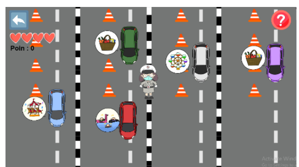
Figure 4.6: Mini-game "Limiting Mobility"

This game has settings inside the crowded roadway. In this era of COVID-19, we should travel outside the home only if necessary, so the rule of this game is to tap a car that wants to go to a public place like a swimming pool and entertainment area, and don't tap the car that has a necessary. Figure 4.6 below is the user interface of the minigame "Limiting Mobility".