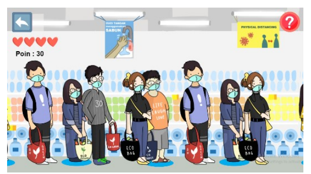
Figure: 4.1 Mini-game "Keep the Distance"

COVID-19 pandemic, we should keep our distance from other people to prevent the spread of the virus. So, the rule of this game is that the player must tap on the people who don't stand above the blue sign. Figure 4.1 below is the user interface of the mini-game "Keep the Distance".