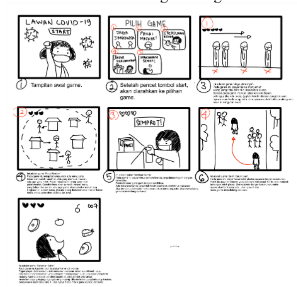
Figure: 3.1 The rough design sketch of the "New Normal" game

rough drawing along with an explanation in each image as shown in Figure 3.1. Then, through the rough sketch of the image, the creation of assets in the game begins.