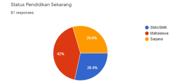
Figure 4.7: Education Status Percentage

Figure 4.7 below showed that most respondents were from college student education status reaching 34 respondents, while respondents with high school education status were 23 out of 81 people, and respondents with undergraduate education status were 24 respondents out of a total of 81 respondents.