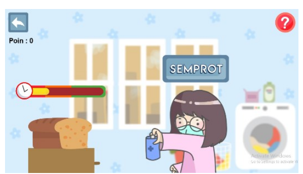
Figure 4.3: Mini-game "Sterilize Things"

This game has the settings in the house. In this game, there is a table on which there will be items that change randomly. The rule in this game is, the player must spray all the items, except foods. Figure 4.3 below is the user interface of the mini-game "Sterilize Things".