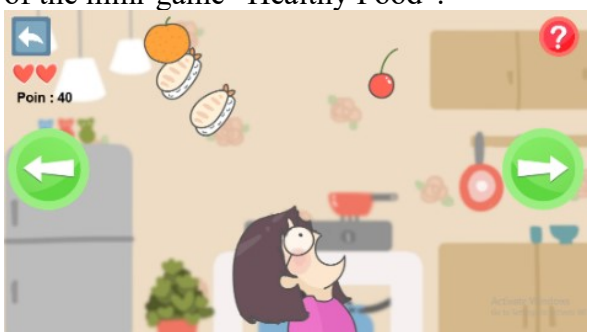
Figure 4.5: Mini-game "Healthy Food"

This game has the settings inside the house. In this era of COVID-19, we must not eat the half-done foods, so the rule of this game is to avoid Marie eating the half-done food like medium-rare steak and sushi by pressing the left and right button to move Marie. Figure 4.5 below is the user interface of the mini-game "Healthy Food".