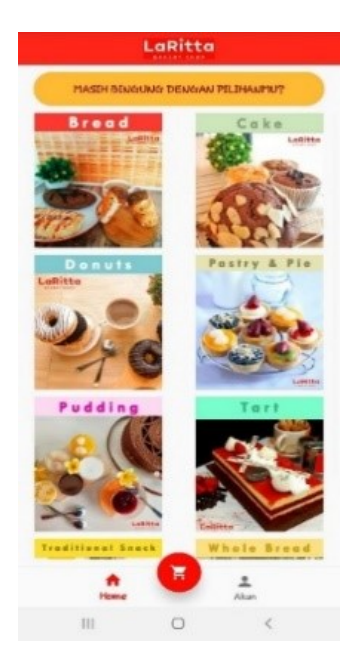
Figure 2. menu display user based on Android App

Applications that are used by Androidbased customers are designed for registration, application login, selecting products, transactions, checking orders, and rating orders that have been made