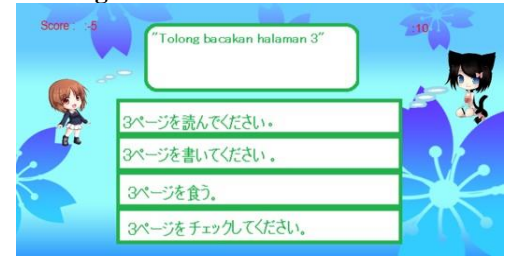
Figure 3.5 Preview Game Level 4

This is the last stage which contains a sentences that player must choose whether a, b, c, or d answer.