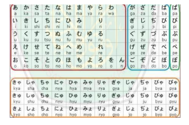
Figure 1.1 Hiragana Strokes

Hiragana letters (平 仮 名) represent from a single word, hiragana is used only to write words that are originally from Japan only.Hiragana letters are formed from modification and simplification, so hiragana letters have curved lines and are not sharp angles. In connection with this, Takebe (1998) mentions that hiragana letters began to be used in the Edo era, which at first was used by women so that hiragana is known as female letters, in Japanese it is called onnade.[5]. Hiragana letters have a total of 46 letters and include 5 vowels, namely a I u e o and the rest are syllables that line up ka, sa, ta, na, ha, ma, yes, ra, wad and one consonant and the words wo which are sometimes pronounced o[11].